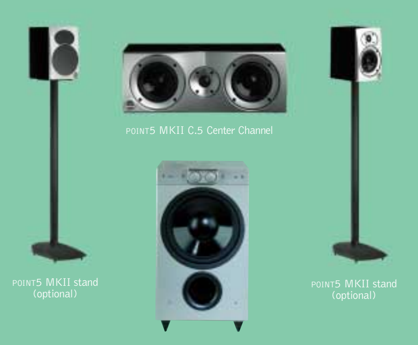
Recommended subwoofer (optional) AS-P300/AS-P400

A STYLE THAT'S ALL YOUR OWN...athena TECHNOLOGIES™ POINT5 MK II sound system has also been intuitively designed to let you create your own style. Complement your décor with the sleek, sophisticated styling of a silver baffle with a high gloss black finish. If you select the components separately, black baffles are available. And because these speakers are magnetically shielded, you can place them virtually anywhere you like. Want to take performance even further? The S.5 satellites from this system can be used as rear channel speakers with athena's SCT™ (System Creation Technology) series. Exceptional sound performance to suit your senses, style and budget. That's the point of POINT5 MKII.